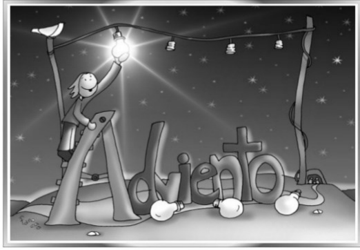
Domingos de Adviento